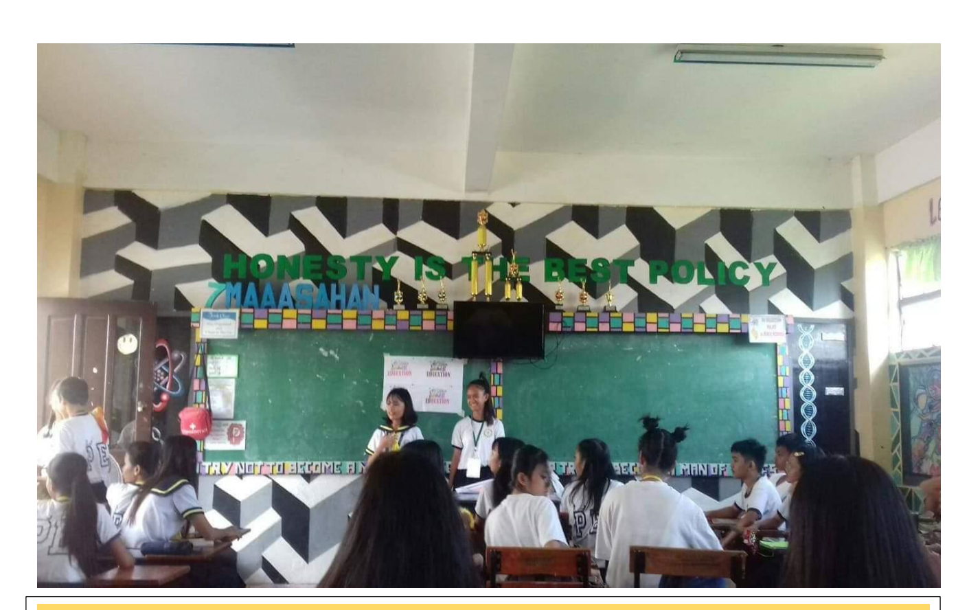
Officers lead the Peace Campaigns with a smile