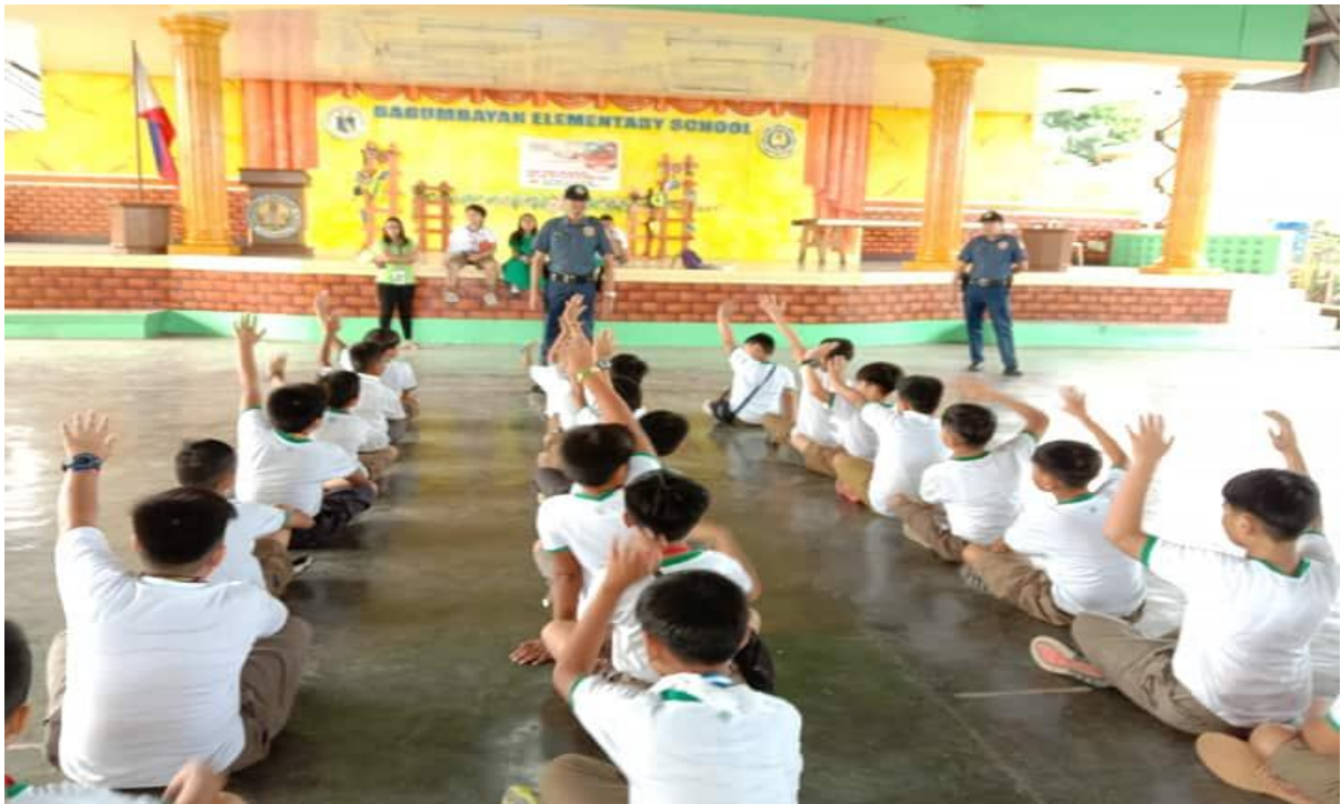
Conduct training activities in standardizing self discipline