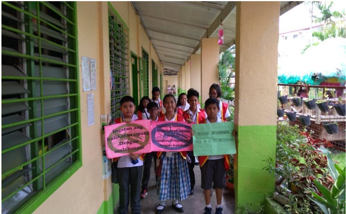
KIDS Patrol Activities- IWAS DENGUE ( Anti Mosquito Bite)