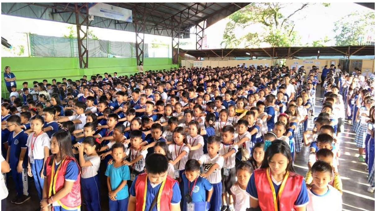
KIDS Patrol Best Practices- Monitoring the flag ceremony everyday.